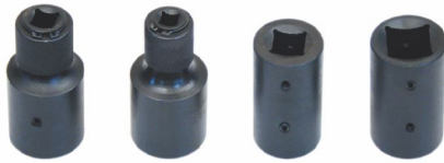
HYDRAULIC DRIVE SOCKET