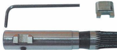
TOOL BIT HOLDER WITH TOOLBIT